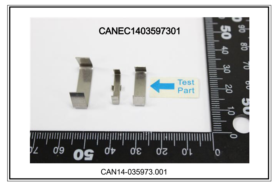
SGS authenticate the photo on original report only